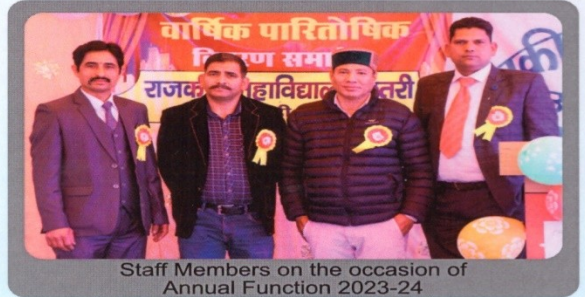
Staff Members on the occasion of Annual Function 2023-24