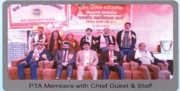
PTA Members with Chief Guest & Staff