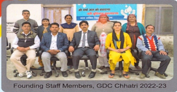
Founding Staff Members, GDC Chhatri 2022-23