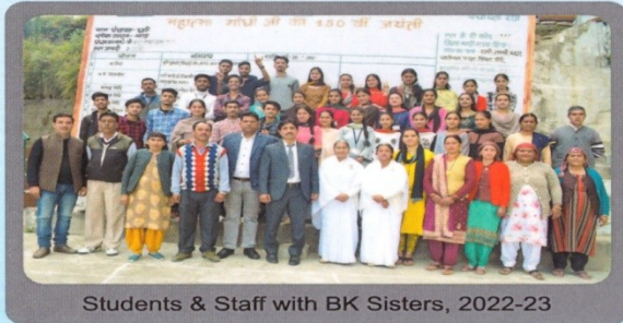
Students & Staff with BK Sisters, 2022-23