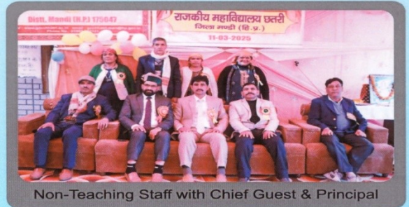
Non-Teaching Staff with Chief Guest & Principal