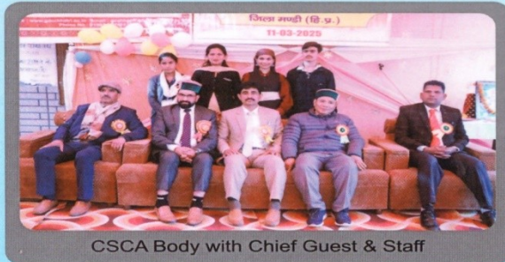
CSCA Body with Chief Guest & Staff